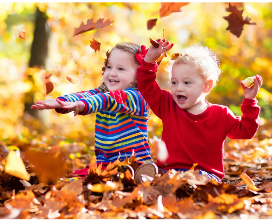
Get back to spending time doing things you enjoy! Sign up for eBill today and make managing your energy bill easier.

With our convenient payment options, it's easy to manage your monthly energy bills so you can spend time doing things you enjoy. Sign up today by visiting mainenaturalgas.com .