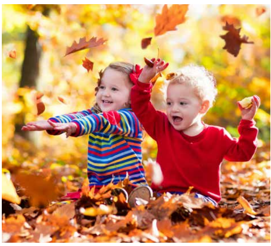
Get back to spending time doing things you enjoy! Sign up for eBill today and make managing your energy bill easier.

With eBill (and AutoPay ), it's easy to manage your monthly energy bills so you can spend time doing things you enjoy. Sign up today by visiting mainenaturalgas.com